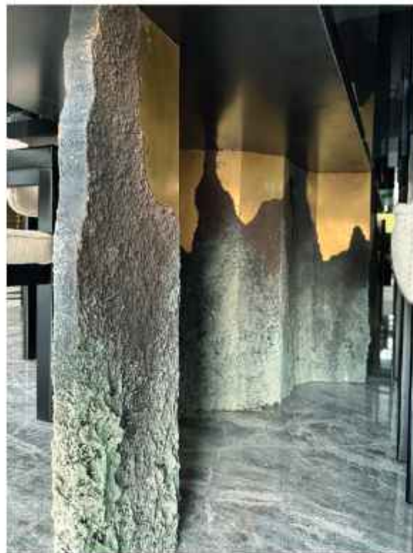
Customized Dinning Table; combination of wood, copper, glass and special coloured plastering creating that marvellous piece.