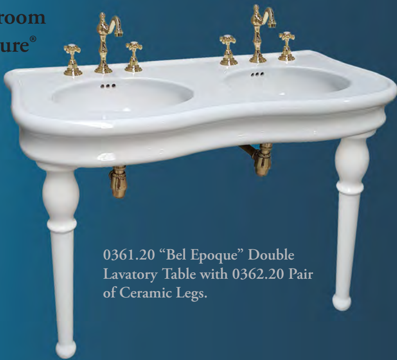
0361.20 "Bel Epoque" Double Lavatory Table with 0362.20 Pair of Ceramic Legs.