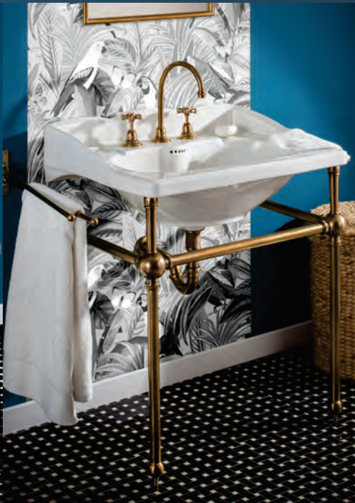
0370.20 & New 0371.47 "Art Deco" Washbasin and Metal Washstand. Shown in French Weathered Brass with New 2802.47 "Lille" 3-Hole Lav. Mixer.