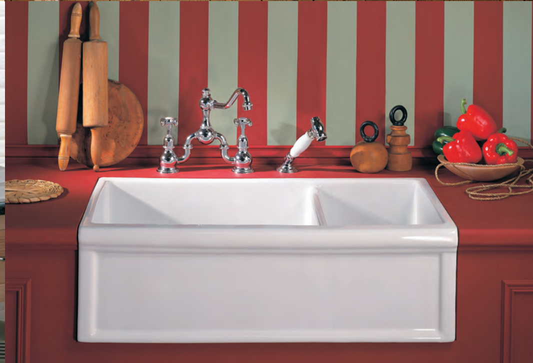
Above: 4603.20 “Luberon” Fireclay Farmhouse Sink in White (20) and 5701.63 Wooden Stand. Shown with 4107.63.58 “De Dion” Wall Mounted Single Lever Mixer in Polished Copper & Brass (58). Below: 4614.20 “Art Nouveau” Fireclay Farmhouse Sink. Shown in White (20) with 4106.63.56 “Estelle” Wall Mounted Single Lever Mixer in Polished Nickel (56).