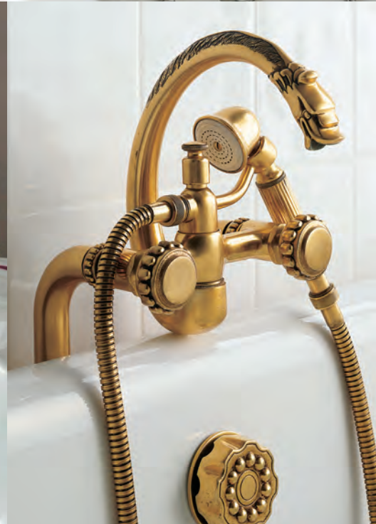
Above: 0705.02 Cast Iron “Josephine” Bathtub with 2236.52 “Pompadour” Deck Mounted Tub Filler and 2239.52 Free Standing Adduction Pipes. Below: 0711.58 “Medicis” Copper Bathtub with 2239.55 “Pompadour” Deck Mounted Tub Filler and 2239.55 Free Standing Adduction Pipes in Pol. Brass (55).