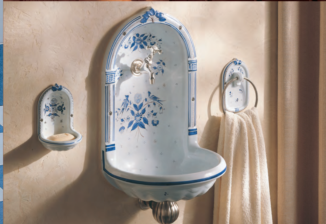
Below: 0201.02 "Niche" Fountain, 1102.02 Soap Dish and 1112.02.53 Towel Ring in Moustier Bleu (02) with 2113.53 "Retro" Tap in Old Silver (53).