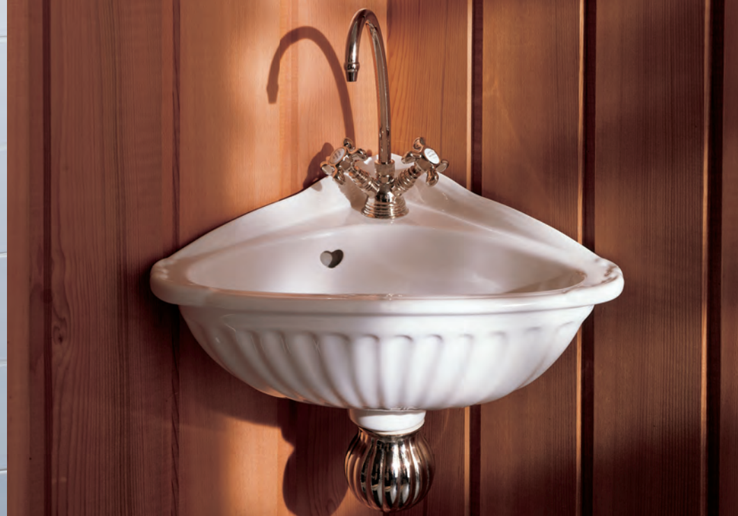
Above: 0106.20 "Carline" Corner Sink with 2121.56 "Sphere" Cover and 3050.56 "Royale Verseuse" Single-Hole Mixer in Polished Nickel (56).