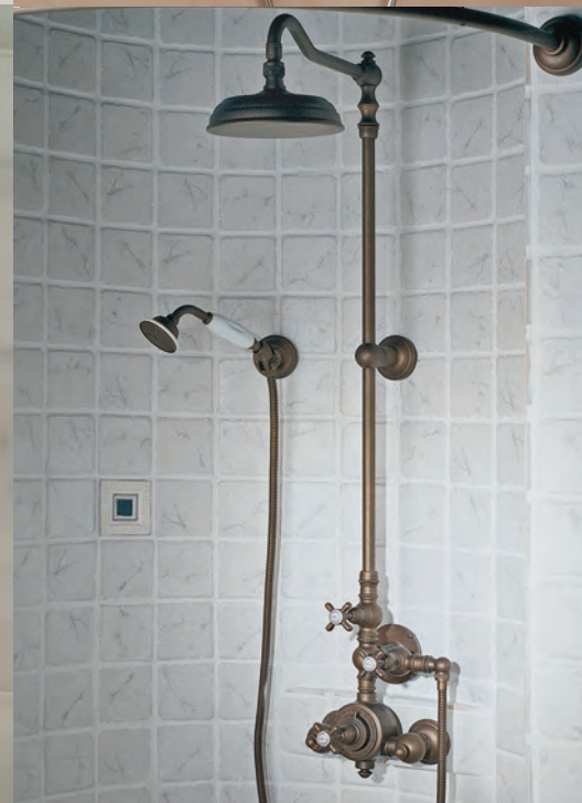
Above: 3062.55 "Royale" Showerhead & 3046.55 Slide Bar in Polished Brass (55). Below: 3049.80 "Royale" Thermostatic Shower Valve in Pol. Lacq. Copper (80).