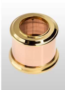
58 POLISHED COPPER (& BRASS)