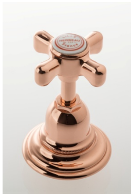
80 POLISHED LACQ. COPPER