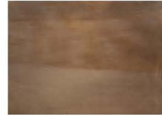
47 FRENCH WEATHERED BRASS