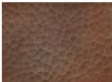
61 HAMMERED WEATHERED COPPER