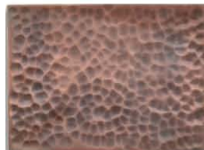
82 HAMMERED FRENCH WEATHERED COPPER