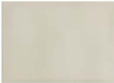
56 POLISHED NICKEL