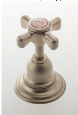
60 SATIN NICKEL