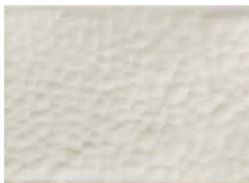
77 HAMMERED BRUSHED NICKEL