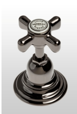
71 POLISHED BLACK NICKEL (LACQ.)