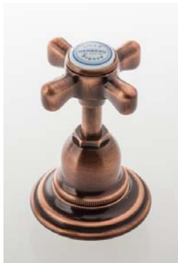
67 ANTIQUE LACQUERED COPPER