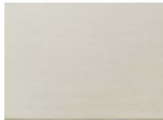
60 SATIN NICKEL