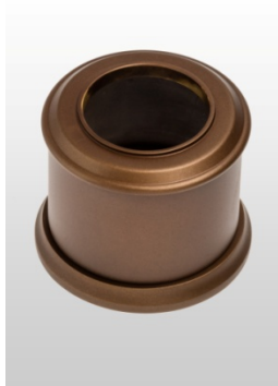
59 WEATHERED COPPER (& BRASS)