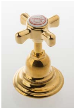
55 POLISHED BRASS (UNLACQ.)

ROYALE / MONARQUE / POMPADOUR / LILLE / KITCHEN / POWDER ROOM