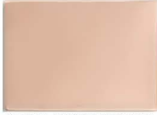
58 POLISHED COPPER

SEINE / MOSELLE / RHONE / SAONE ALL FINISHES ARABESQUE / RINCE DOIGTS 47 / 55 / 70 / 56 / 57 / 60 LOIRE 46 / 47 / 55 / 58 / 59 / 70 / 56 / 57 / 60 BONNE MAMAN 46 / 47 / 55 / 58 / 59 / 70