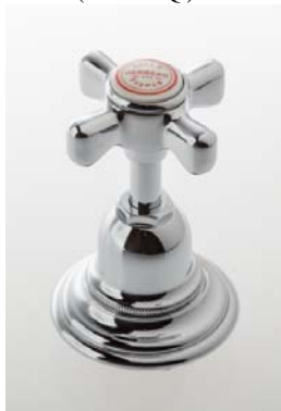
48 POLISHED CHROME