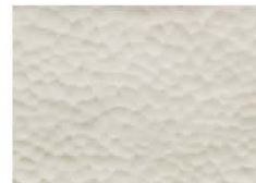
66 HAMMERED SATIN NICKEL