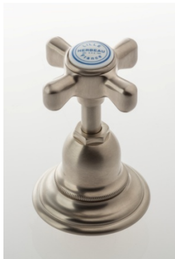
57 BRUSHED NICKEL