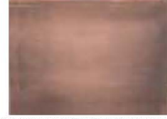
46 FRENCH WEATHERED COPPER