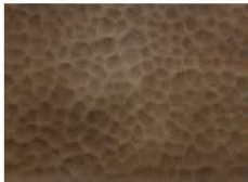
78 HAMMERED WEATHERED BRASS