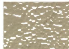
65 HAMMERED POLISHED NICKEL