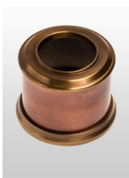
46 FRENCH WEATHERED COPPER (& BRASS)