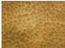
83 HAMMERED FRENCH WEATHERED BRASS