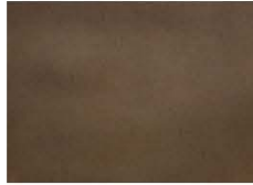
70 WEATHERED BRASS