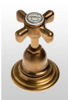
47 FRENCH WEATHERED BRASS