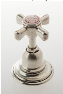
53 OLD SILVER