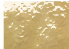
79 HAMMERED POLISHED BRASS