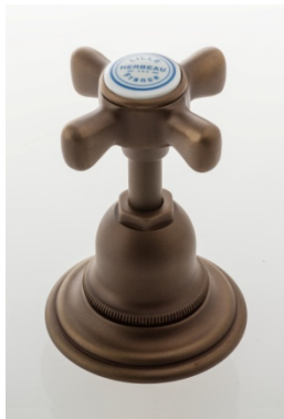
70 WEATHERED BRASS