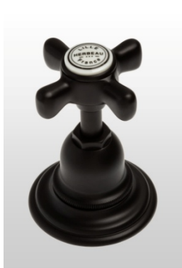
50 MATTE BLACK NICKEL (LACQ.)