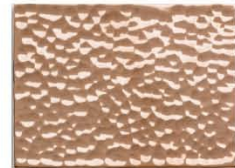
81 HAMMERED FRENCH POLISHED COPPER