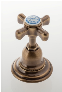
68 ANTIQUE LACQUERED BRASS