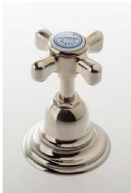
56 POLISHED NICKEL