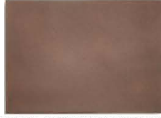
59 WEATHERED COPPER