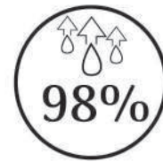
Every Last Drop